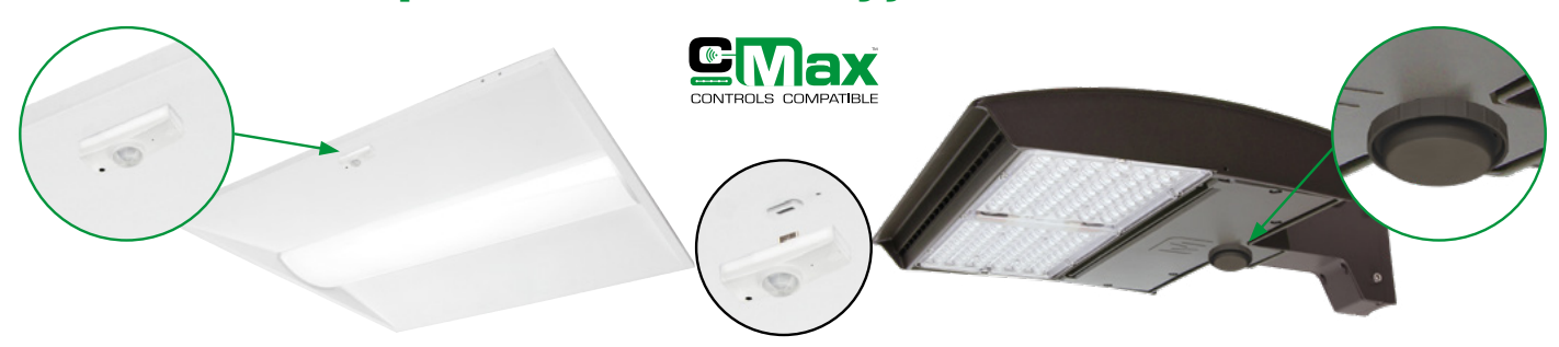
Patent Pending vandal-resistant design with locking screw that secures sensor to fixture.