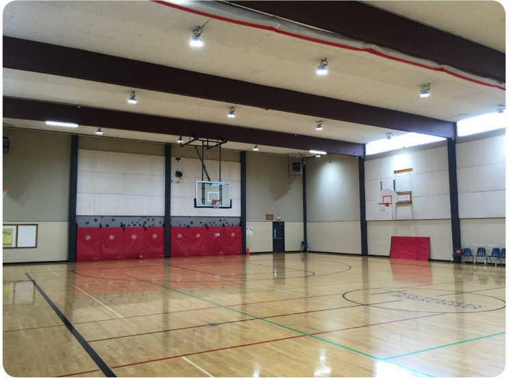
After: The LED fixtures turn on instantly and deliver a brighter, more even light.