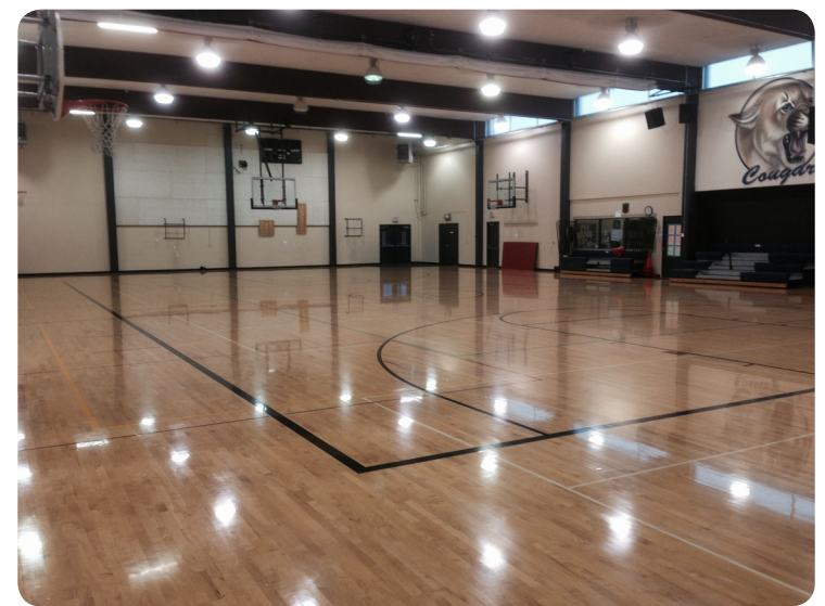
Before: Metal halide fixtures produced glare and required time to warm up.