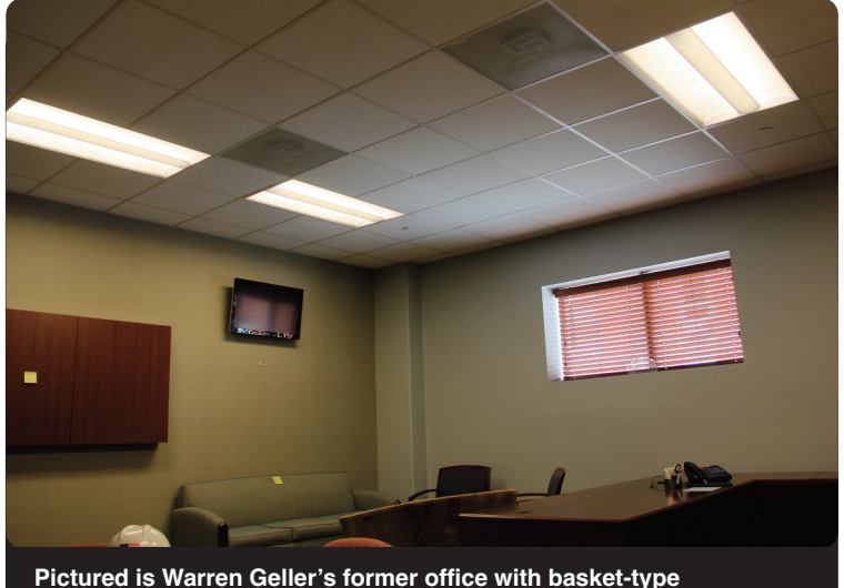
Pictured is Warren Geller's former office with basket-type fluorescent troffers

After the fixtures were installed in his new office, Mr. Geller's support staff asked if they, too, could have the LED products installed in their open office space to brighten it up. Mr. Geller agreed and six additional 2'x2' Direct Lit LED Flat Panels were installed, replacing six fixtures with two 32-watt fluorescent lamps each.