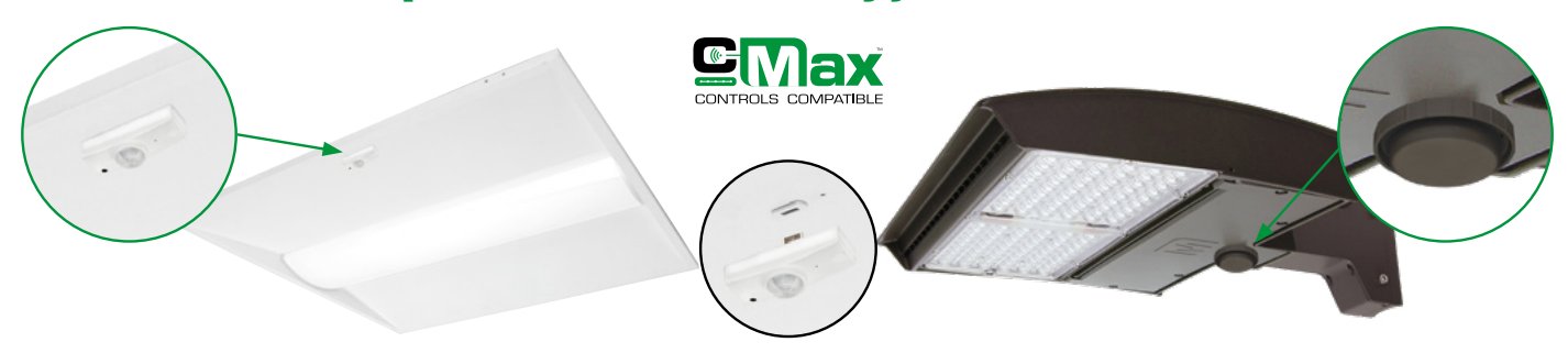
Patent Pending vandal-resistant design with locking screw that secures sensor to fixture.