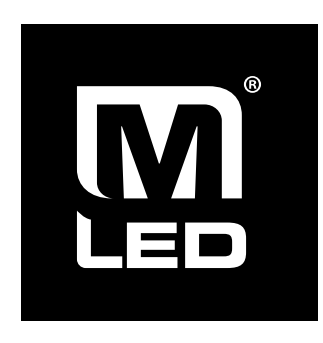
One color (white) on black background