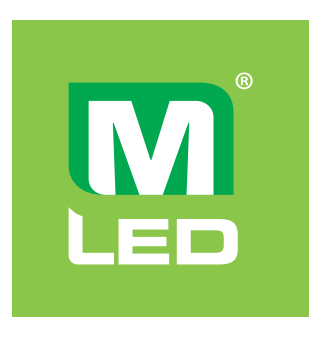
Two color logo on color background