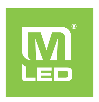
One color (white) on color background