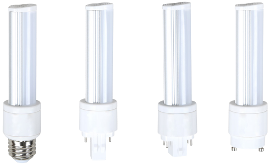
6W E26 6W GX23 6W G24q 6W GU24