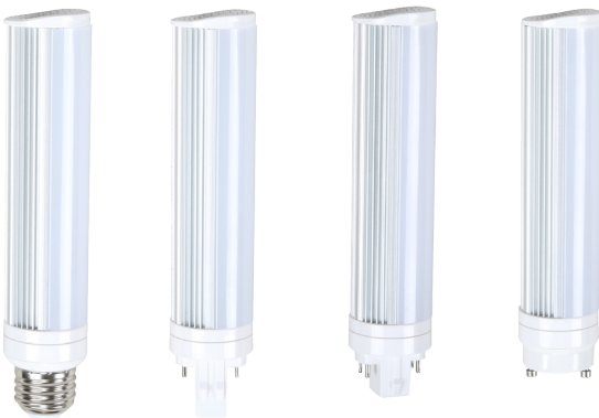
8W E26 8W GX23 8W G24q 8W GU24