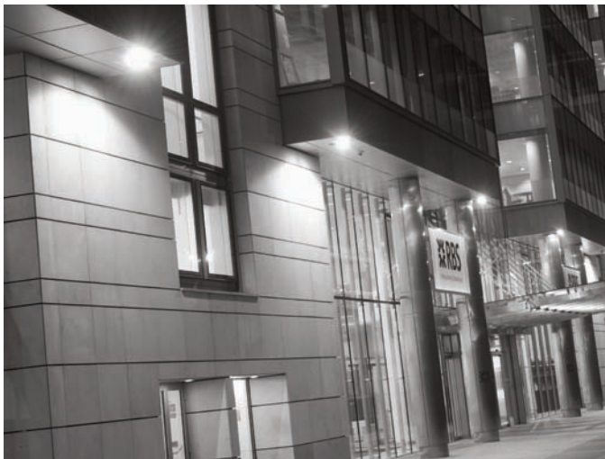
Commercial outdoor application

Installation: Can mount to recessed outlet box or direct to surface.