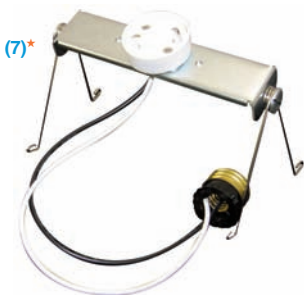
MLFCRK (7) 6762711554 (7)*