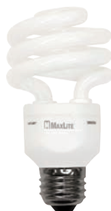
MLS13ES 10,000 Hour