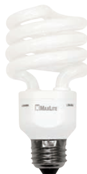
MLS20ES 10,000 Hour