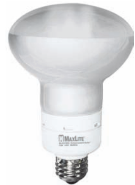
MLR315ES 8,000 Hour (7) 6762711366 (6)*