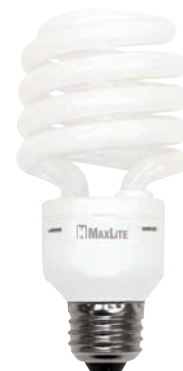
MLS30ES 10,000 Hour