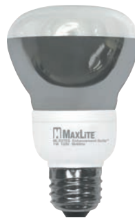
MLR209ES 8,000 Hour (7) 6762711363 (5)*