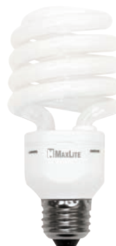
MLS25ES 10,000 Hour