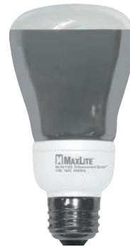
MLR211ES 8,000 Hour (7) 6762711364 (2)*