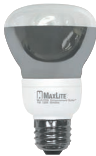
MLR207ES 8,000 Hour (7) 6762711362 (8)*

Look for this logo on ISB Products and on MaxLite.com for more information.