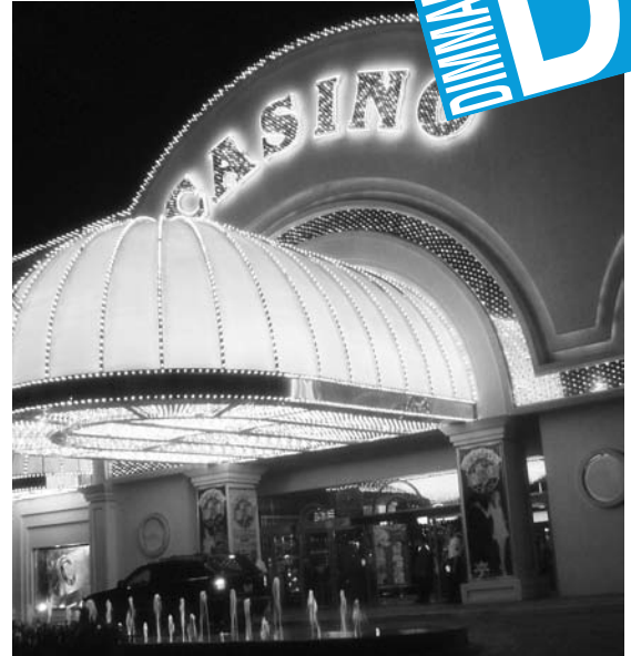
Casino Marquee Signs