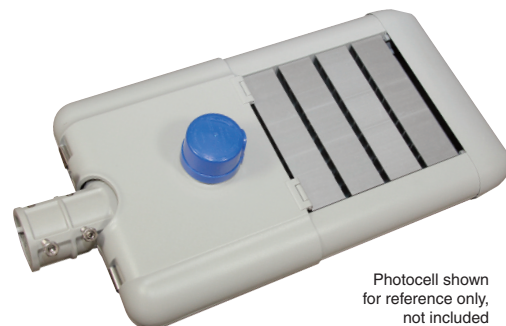
Photocell shown for reference only, not included