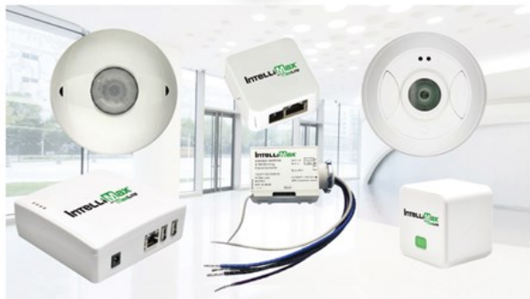
IN TUNE // The IntelliMax networked lighting control system is capable of handling color-tuning system functionality, allowing the adjustment of light colors to mimic human circadian rhythms. MaxLite Inc.